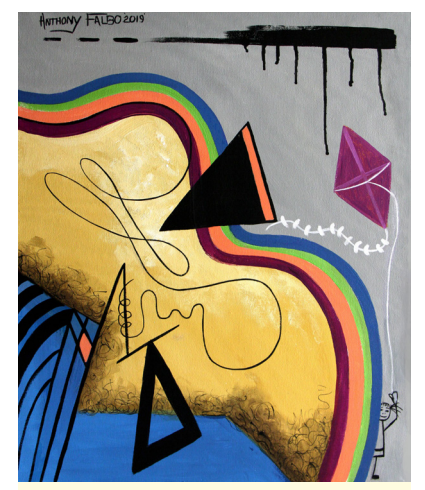
Ask yourself: What do you make of this image – its title is 'With God all things are possible'?

The man is so sure of his worthiness that he runs to Jesus. He has found it easy to please God in his comfortable life. But how will he fare if he has nothing but the offer of treasure in heaven? What is comfortable about your life? What challenge might Jesus give to you about what you need to let go of?